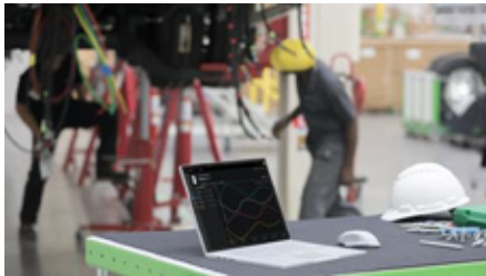
Connect your things to gather data