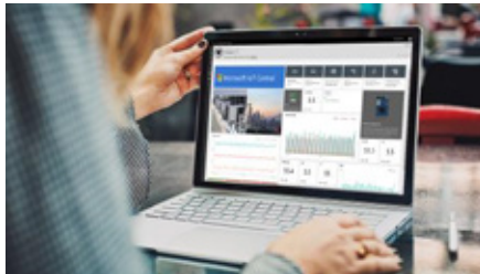
Analyze data to create new insights