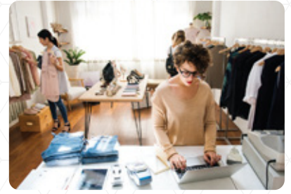
Fashion & Retail