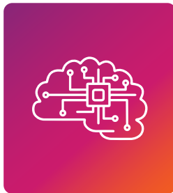
Machine Learning and AI Integration