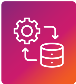
Data Integration and Engineering