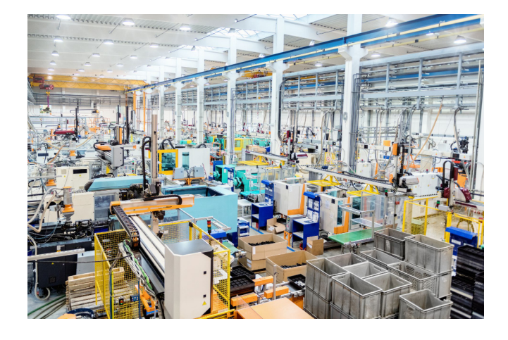
Use Case Scenario: Optimize Supply Chain

A resilient supply chain is the need of the hour.